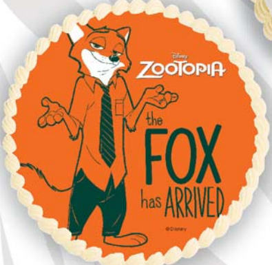
THE FOX HAS ARRIVED 1/2, 1, 2 & 3 kg