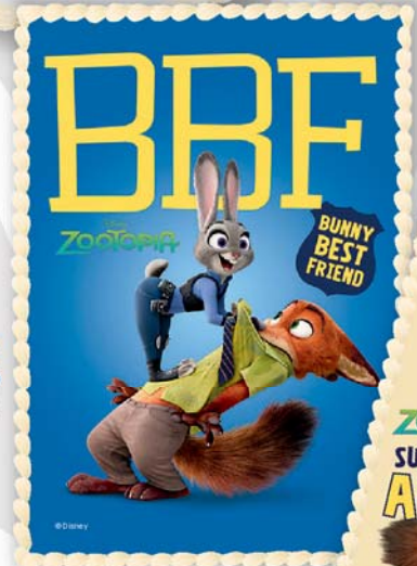
BUNNY BEST FRIEND 1/2, 1, 2 & 3 kg