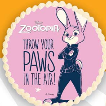
THROW YOUR PAWS IN THE AIR 1/2, 1, 2 & 3 kg