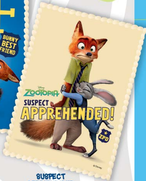
SUSPECT APPREHENDED 2 & 3 kg