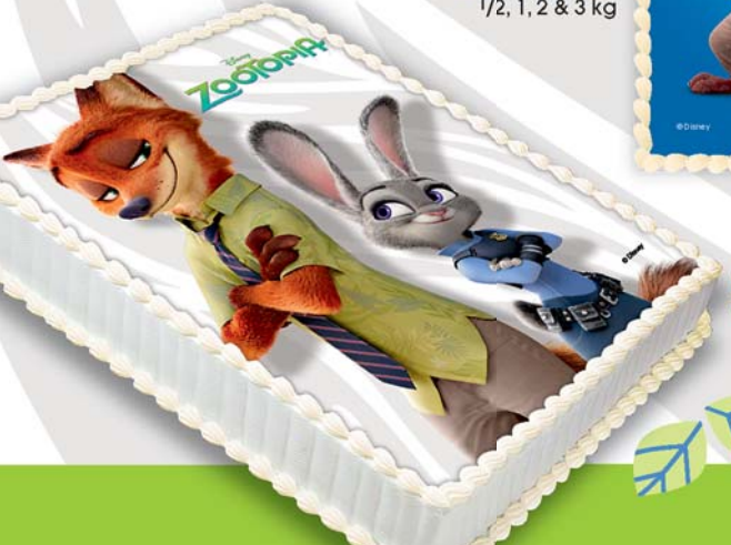
NICK WILDE & JUDY HOPPS 2 & 3 kg